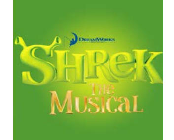
Department of Theatre Announces 2015–16 Season