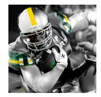
Back to Belhaven Homecoming 2015