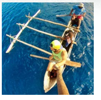
Connecting Cultures Through Language