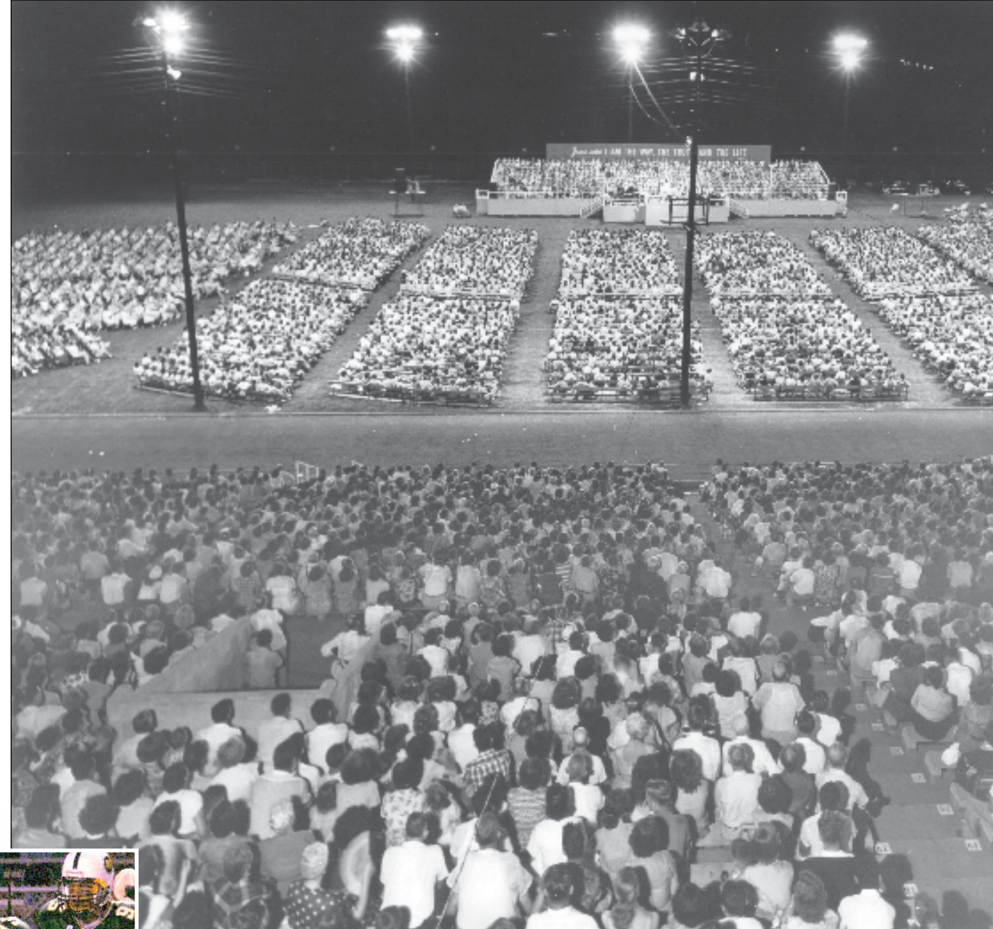
1952: Opening night in Jackson, Mississippi at the Billy Graham Jackson Crusade.

This symbolically powerful gesture marked a major ministry watershed for Graham. He would never again lead a segregated evangelistic meeting.